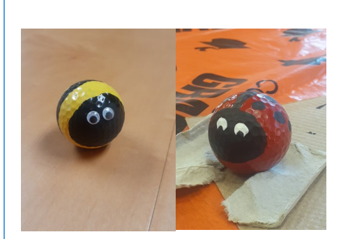
Women in Faith Golf Balls into Art!

All bags will be blessed, and all students/staff will be given a blessed keepsake. As we celebrate God's gift of learning, we will pray for God's blessing on students, staff, families, and schools in the coming year.