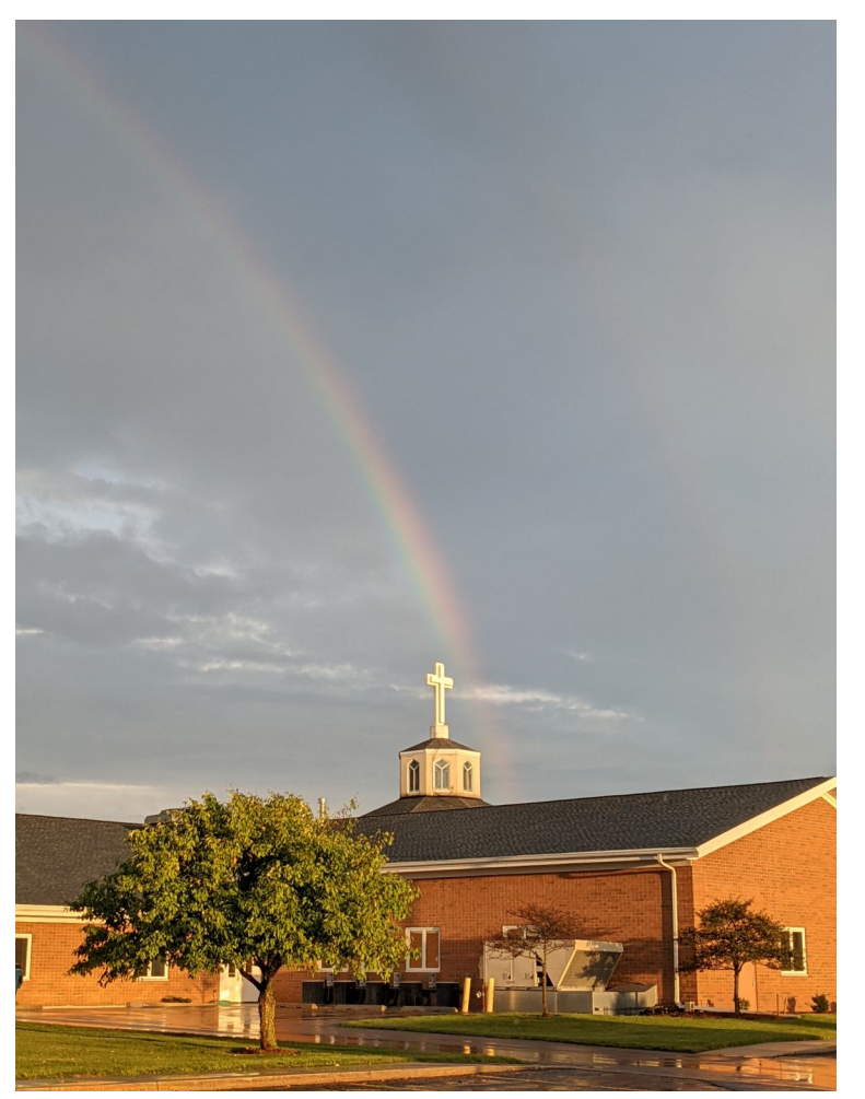
How beautiful is this rainbow over our church!