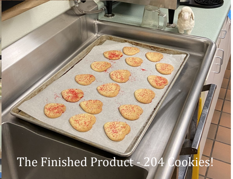
The Finished Product - 204 Cookies!