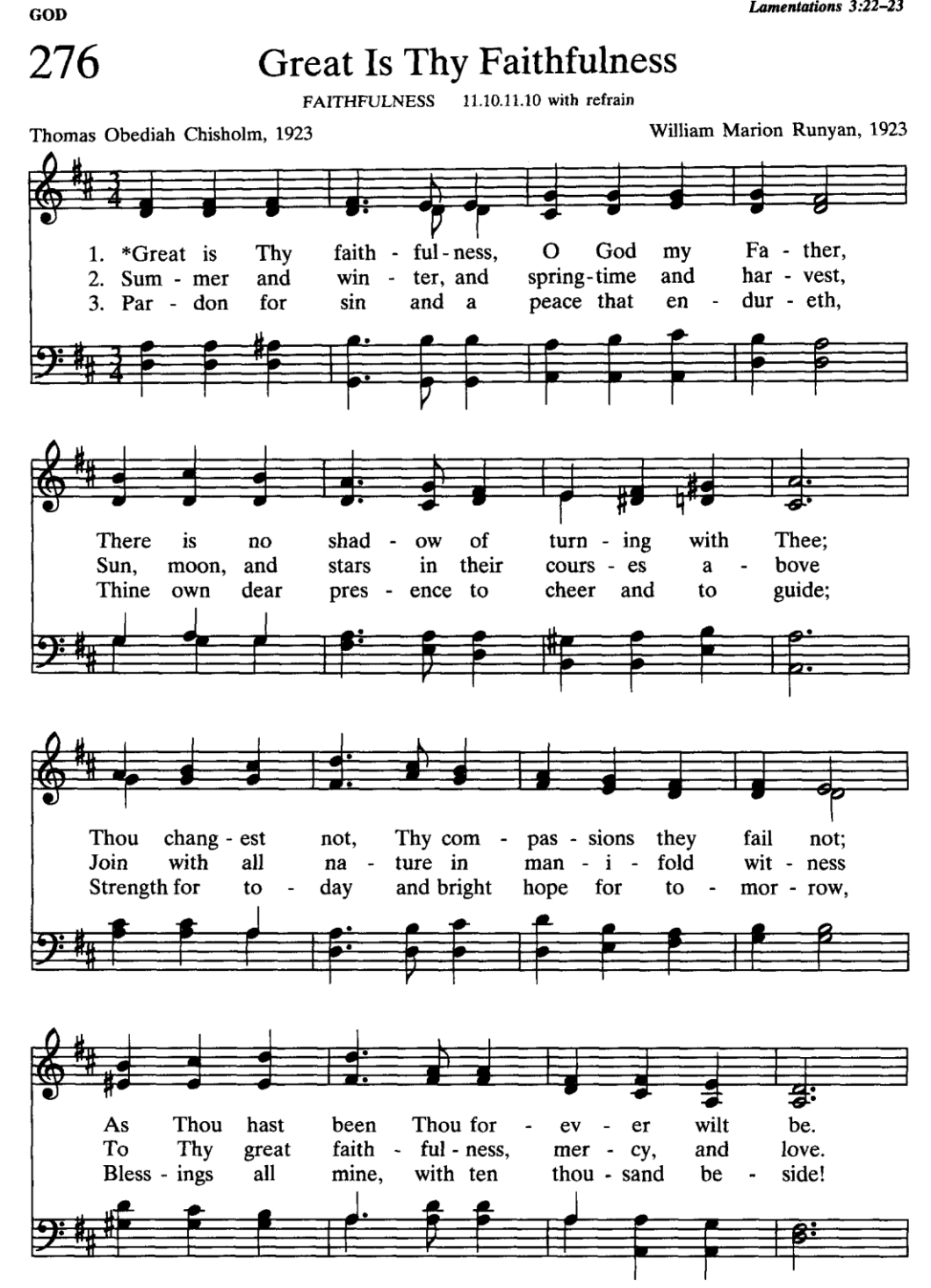
*Or "Great is Thy faithfulness, O God, Creator." Text and Music: Copyright 1923. Renewal 1951 by Hope Publishing Company, Carol Stream, IL 60188. All rights reserved. Used by permission.