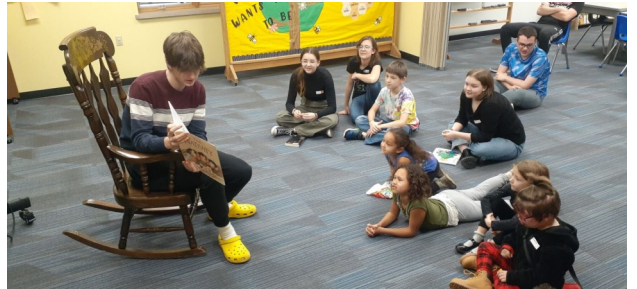
There was Story Time