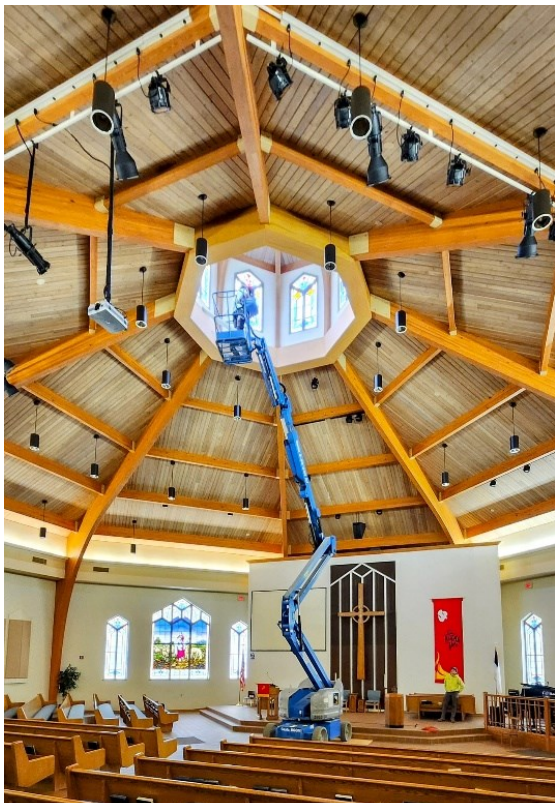
THIS is why the extra-large lift was needed.