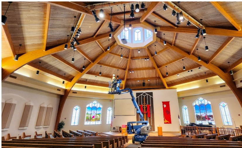
The new lighting looks amazing! Wait until you see what a difference it makes!