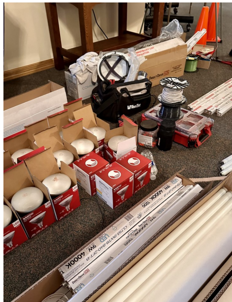
LED Light bulbs of all different sizes and shapes were used to brighten our Sanctuary and Narthex.