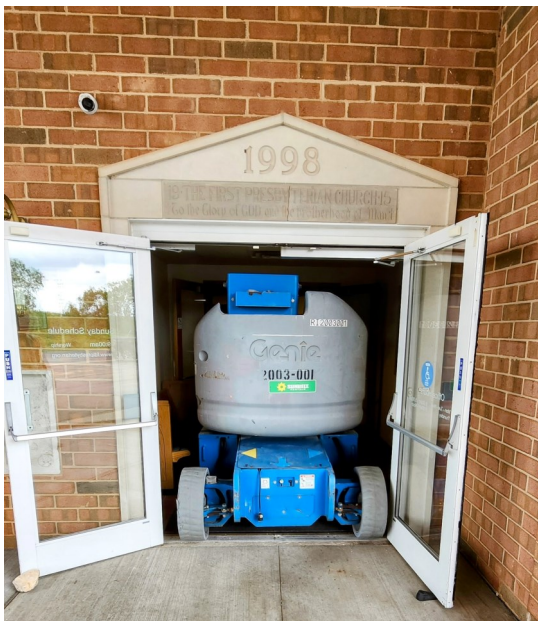
A huge lift was needed to do the work in the sanctuary. There was absolutely no room for error going in and out of the church!