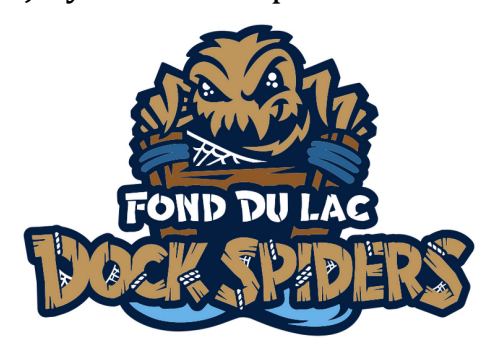
July 14 - Dock Spiders Game