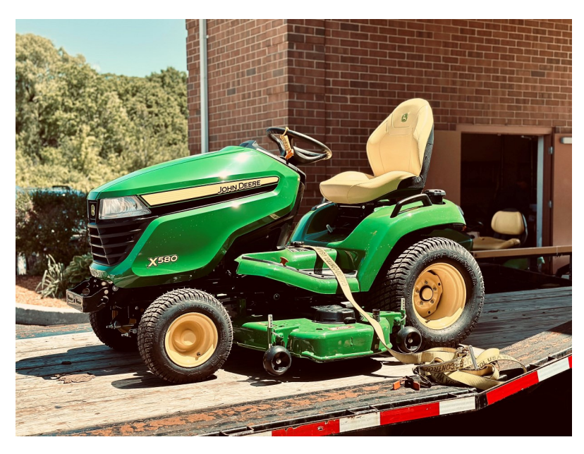
After 26 years of use – cutting grass and plowing snow, it was time to replace our John Deere Tractor. The new one has a much more comfortable seat and power steering!