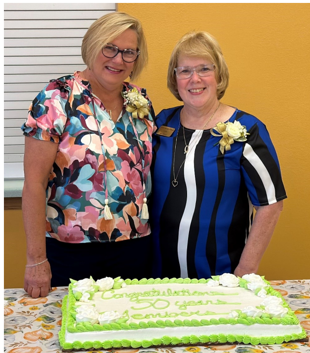
Congratulations to our 50 Year Members

Prayer request cards are available in the Prayer Box located in the Narthex, in the church pews, or online ( click here ). You can place your prayer request in the offering plate or the lock box at the church office door. For electronic prayer requests, please