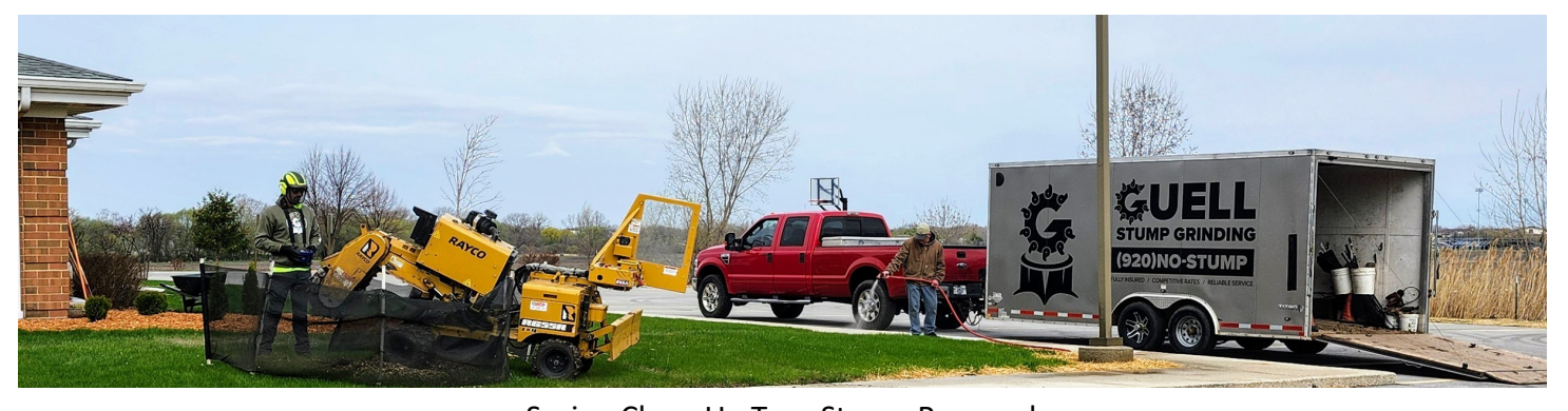
Spring Clean Up Tree Stump Removal.