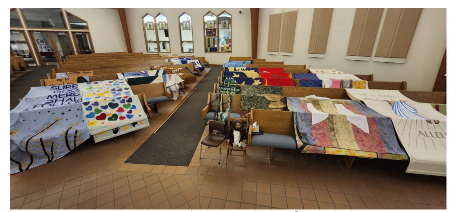
Inventory and Organization of Banners

all. We will be looking for volunteers to help host the event. If that sounds like an opportunity you would like to take advantage of contact the church office.