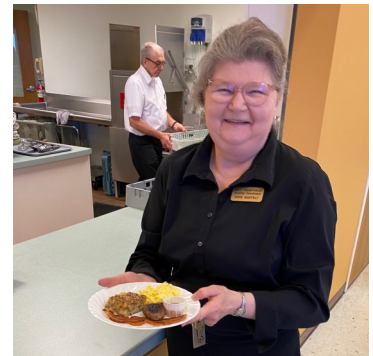
One, of many, many, happy customers.