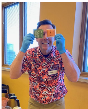
A little shenanigans.