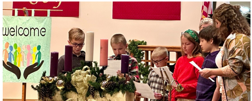
Grade School Class lighting the Advent Candles in worship.