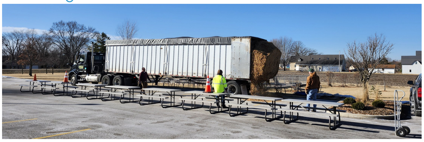
Delivery of mulch for the playground. Thank you to all who helped with the many projects this week in the church.